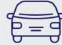
Personal Contract Purchase